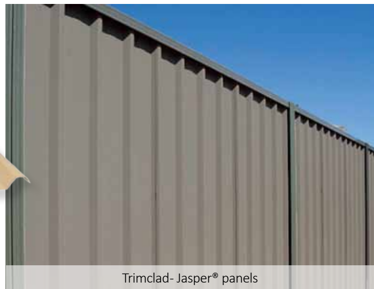
Trimclad- Jasper® panels

Manufactured from Colorbond® and Zinalume® steels. Available in standard lengths in a traditional style that has stood the test of time.