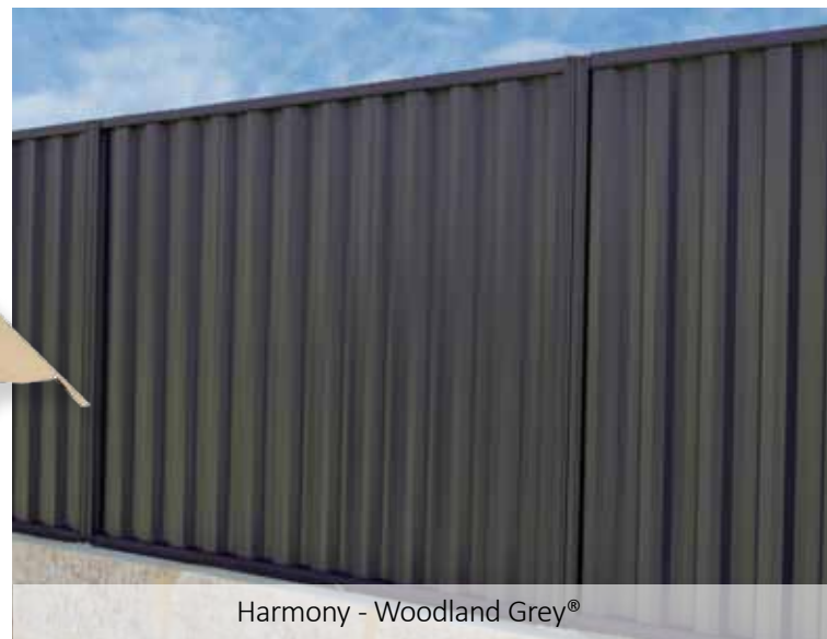
Harmony - Woodland Grey®

Not only does it look great, but it has been engineered to be strong, overlap cleanly and not rattle in the tracks. Harmony is the ultimate in fencing profiles that gives both neighbours the best side of the fence.